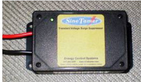
Unit above is a representation only of the ST-SP120-P. Actual unit has 3 wires.